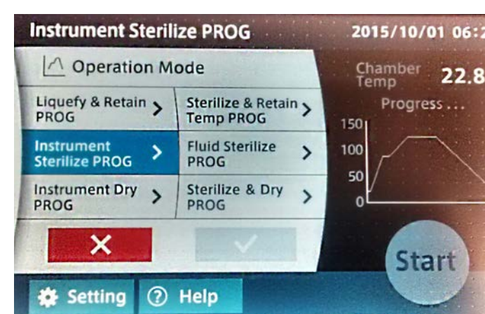
Instrument Sterilize Program