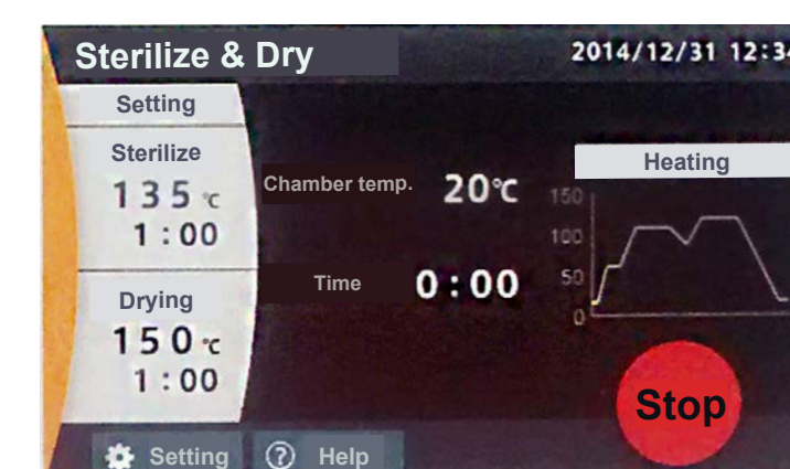
Sterilize & dry operation