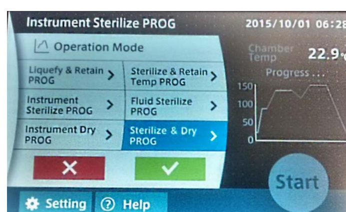
Sterilize & Dry Program