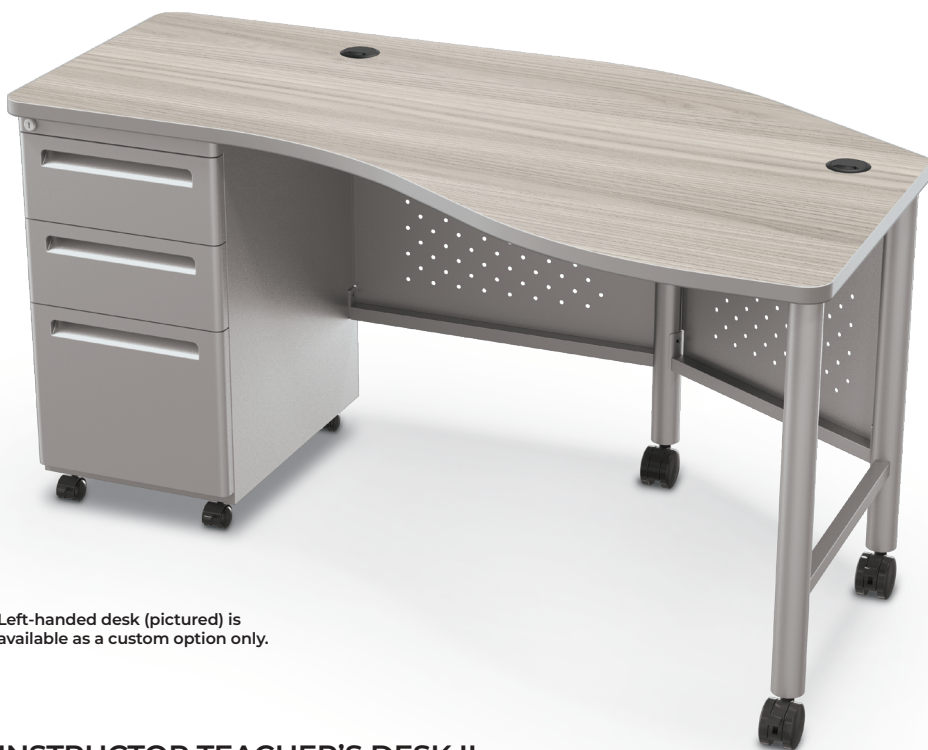
Left-handed desk (pictured) is available as a custom option only.