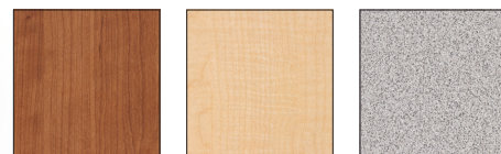
Amber Cherry 7919