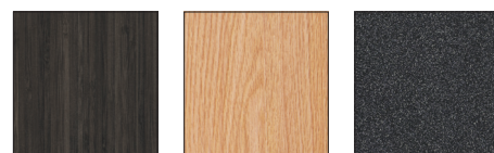
Asian Night 7949