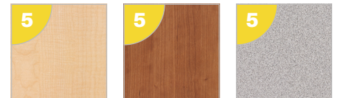
7909 - Fusion Maple