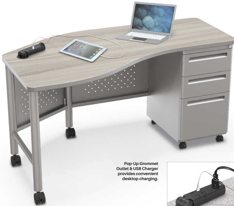
Pop-Up Grommet Outlet & USB Charger provides convenient desktop charging.