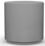
Dot 18"H x 18"W 96R118-VX