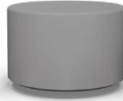
Dot 12"H x 18"W 96R112VX