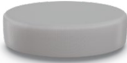
Dot 5"H x 18"W 96R105-VX