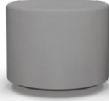
Dot 12"H x 15"W 97R112VX