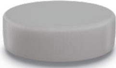
Dot 5"H x 15"W 97R105-VX