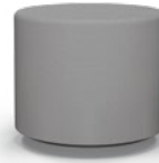
Dot 15"H x 18"W 96R115-VX