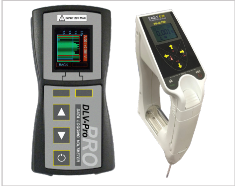
DLV-Pro Voltmeter & SG-Ultra Digital Hydrometer