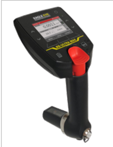
SG-Ultra Max Plus