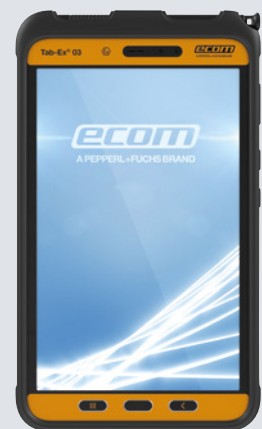
Tab-Ex® 03 D2