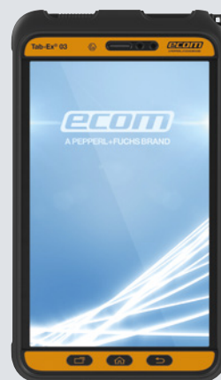
Tab-Ex® 03 DZ2

To protect your investment, we offer a three-year service level agreement so your mobile assets are covered for your operational needs.