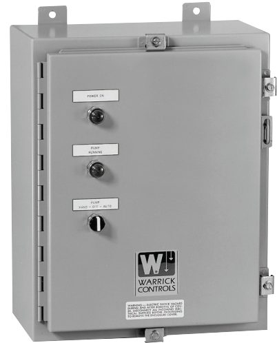
Single-function standard panel