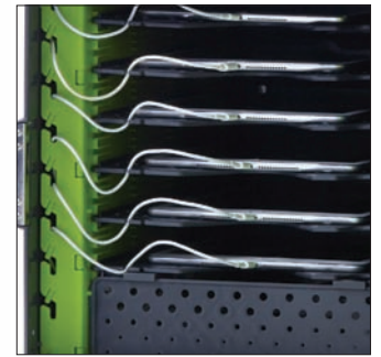
Side cable organizer to keep cords tidy