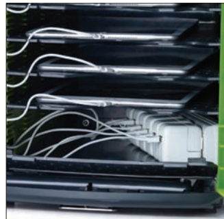
Lower compartment for power strip and adapters