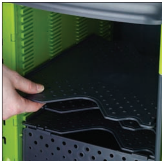
Adjustable dividers to accommodate a wide range of devices with and without cases