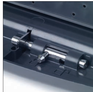
Surface mount hardware to secure tub to surfaces for added security