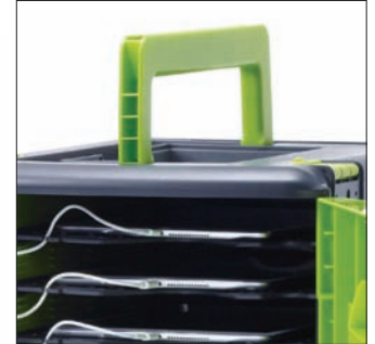
Top flip-up handle to make carrying easier