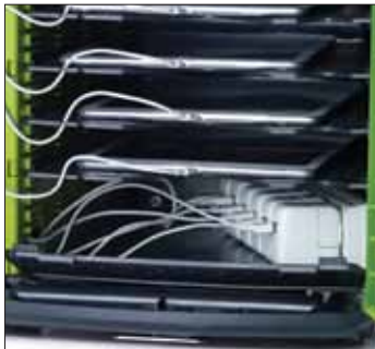
Lower compartment for power strip and adapters