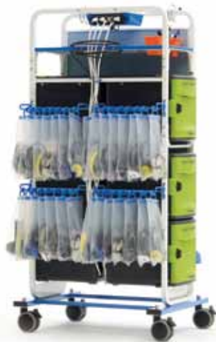
Dual Duty Teaching Easel (FTT200) (back view)