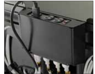
Premium Cart Power timer for charging (requires 1 outlet)