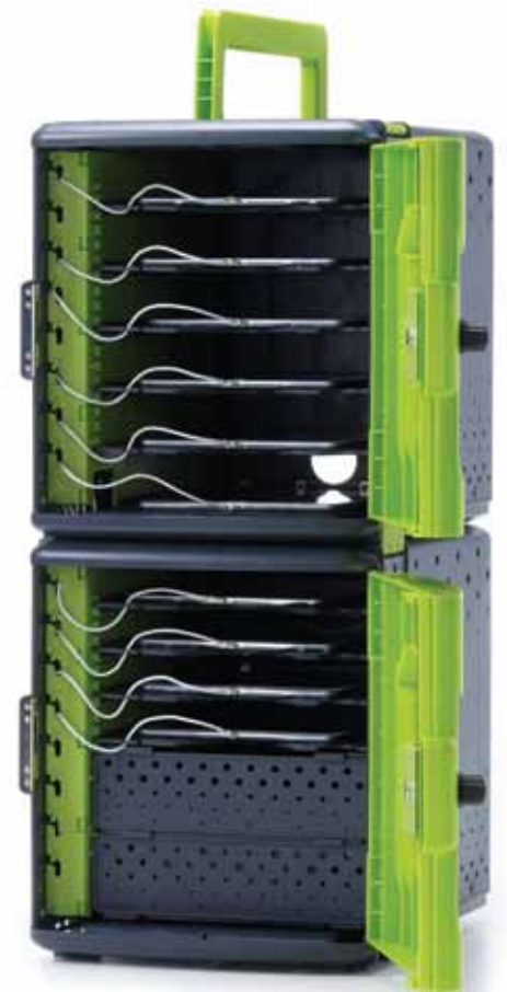
Premium Tech Tub ® - holds 10 devices (FTT1000)