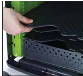
Adjustable dividers to accommodate a wide range of devices with and without cases