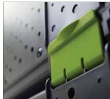
Side clips connect multiple tubs together and easily break apart for sharing devices