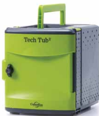
Premium Tech Tub ® - holds either 6 iPads ® , Chromebooks ™ , or a combination of both (FTT600)