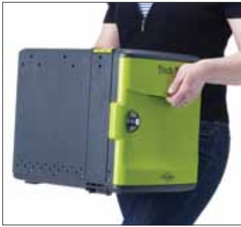
Ergonomic front and back handles