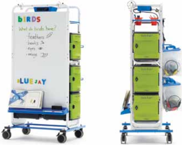
Dual Duty Teaching Easel (FTT200)

The Dual Duty Teaching Easel was designed to make the most of every inch in the classroom by combining technology with a traditional teaching easel.