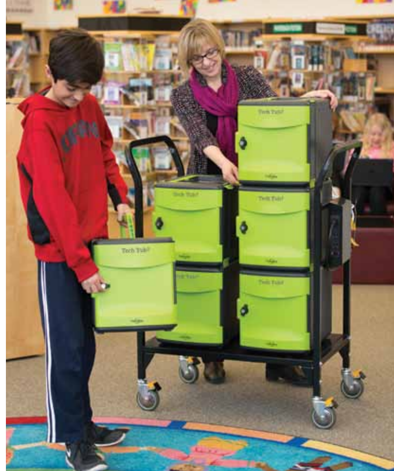
Modular Cart with 6 Premium Tech Tubs® - holds 32 devices (FTT632) 2 lower tub sets are permanently connected together