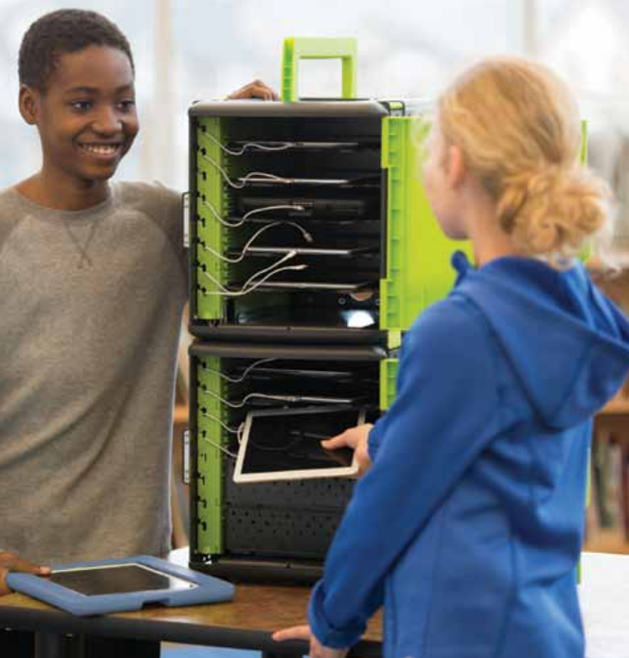
Premium Tech Tub® - holds 10 devices (FTT1000)