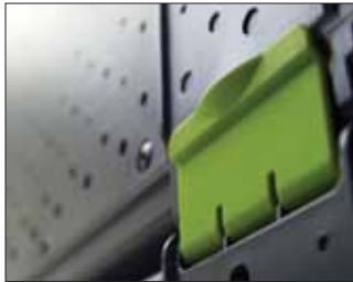
Side clips allow you to connect multiple tubs together and easily break apart for sharing devices