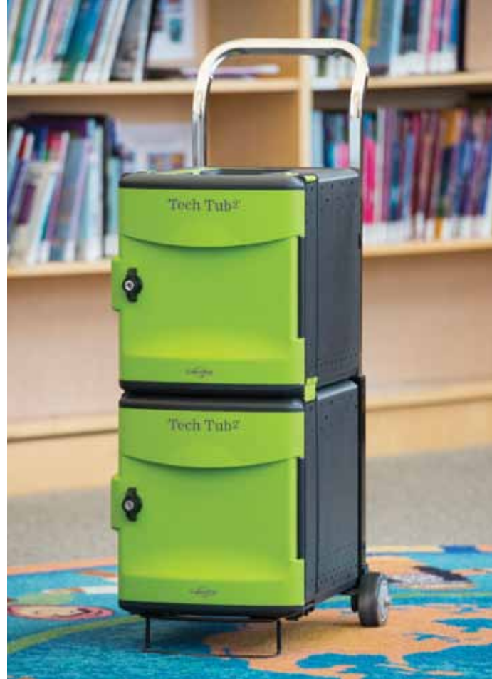
Trolley with 2 Premium Tech Tubs® - holds 10 devices (FTT1010) Tubs are permanently connected