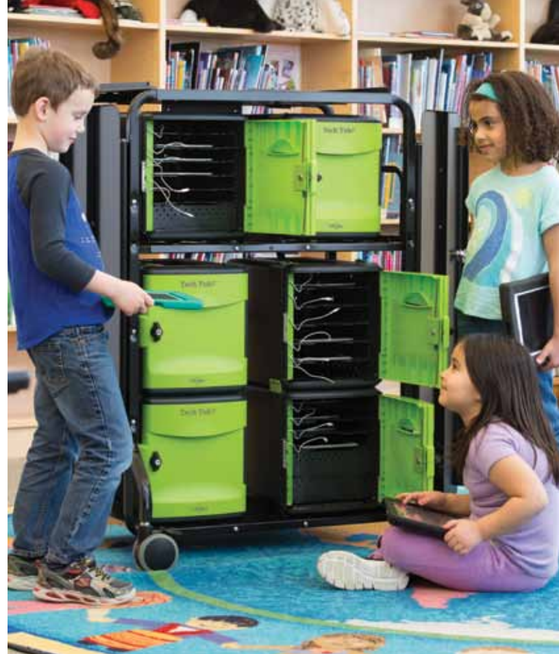
Premium Cart with 6 Premium Tech Tubs® - holds 32 devices (FTT432) 2 lower tub sets are permanently connected together