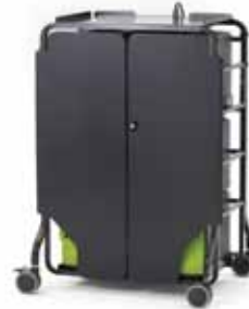
Premium Cart High security model with locking doors