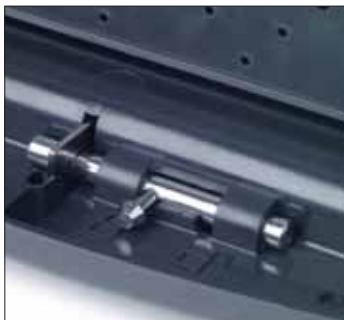
Surface mount hardware to secure tub to surfaces for added security