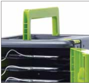
Top flip-up handle to make carrying easier