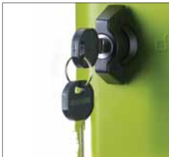
3-point door lock with 2 keys