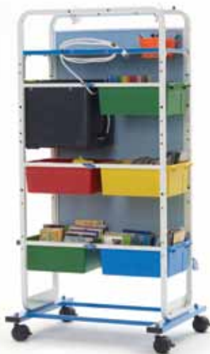
Dual Duty Teaching Easel (FTT202) Holds 1 Premium Tech Tub® (6 devices) and 5 Open Tubs (back view)