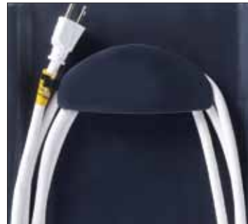
Cable management hooks with a cord clip on the back