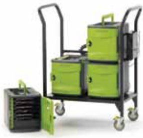
Modular Cart with 4 Premium Tech Tubs® - holds 24 devices Tubs break apart using clips (FTT624)