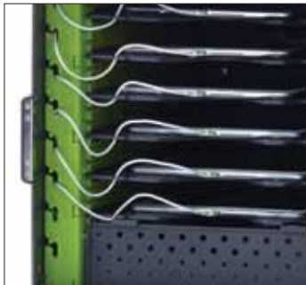
Side cable organizer to keep cords tidy