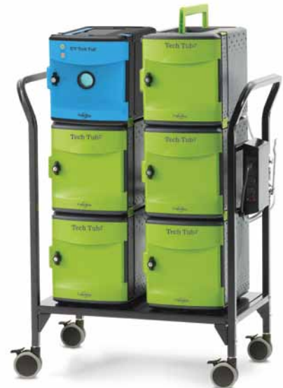
Tech Tub 2 ® Modular Cart with UV Tub Charges 26 devices