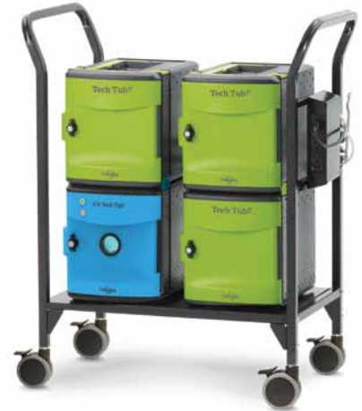
Tech Tub 2 ® Modular Cart with UV Tub Charges 18 devices

*** If you remove your UV tech Tub from the Modular Cart, do not place the UV Tech Tub on the floor. Only place the UV Tech Tub on surfaces that are at least 30" above the floor. This is to prevent accidental collisions that can cause damage or injury from impact and tip over.