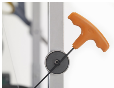
Magnetic tool holders