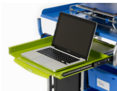
Sliding laptop tray