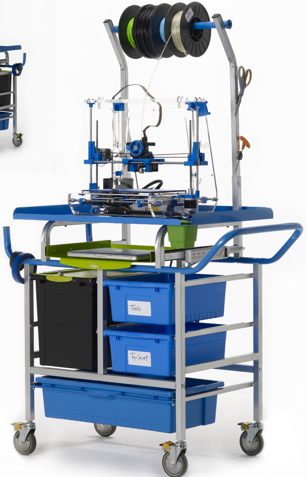
Premium 3D Printer Cart (front view)