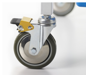
4" Casters, two locking