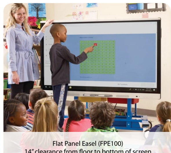
14" clearance from floor to bottom of screen