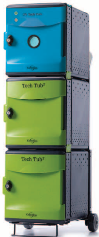
Trolley - Charges 10 devices (FTT2010-UV)

UV Tech Tub: Lifetime on Tub components and 1 year warranty on UV bulbs and electrical components.