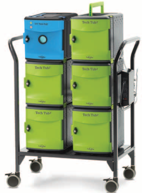
Modular Cart with UV Tub Charges 26 devices (FTT726-UV)