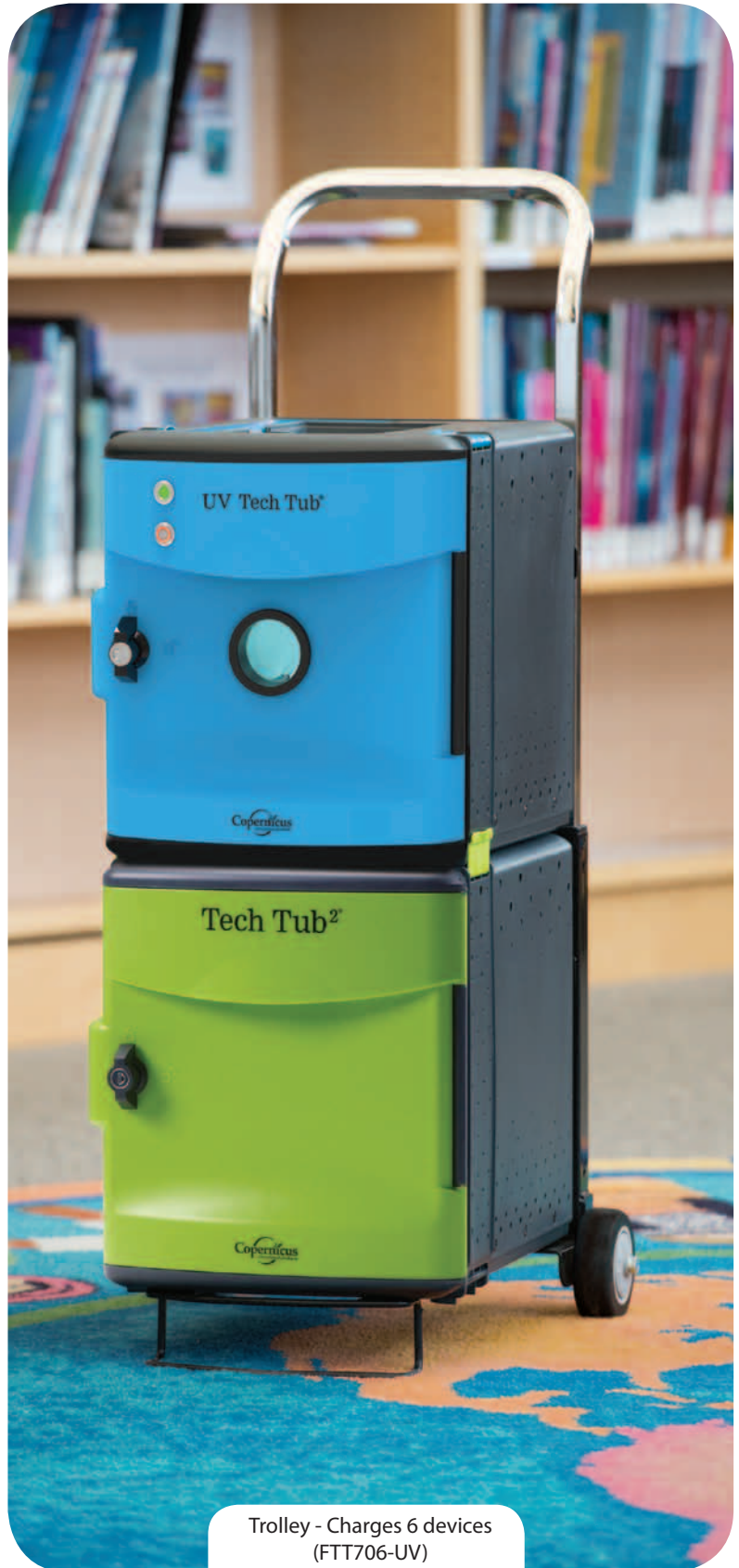
Trolley - Charges 6 devices (FTT706-UV)