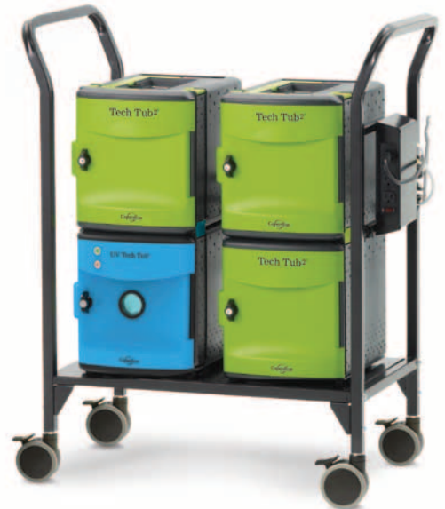
Modular Cart with UV Tub Charges 18 devices (FTT718-UV)

*** The UV Tech Tub can be attached to trolleys with other UV Tech Tubs and Tech Tub 2 s for easy transportation and storage. Before operating the UV Tech Tub, remove it from the trolley and place on a surface that is at least 30” above the floor. Do not place the UV Tech Tub on the floor. This is to prevent accidental collisions that can cause damage or injury from impact and tip over. The same applies if you remove your UV Tech Tub from the Modular Cart, do not place the UV Tech Tub on the floor.