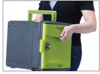
Easy to carry with ergonomic handles on the door and back and a flip-up handle on top

*Pricing is USD MSRP 2016 **Weight without devices