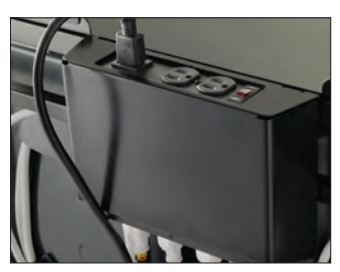
Power timer for charging (requires only 1 outlet to wall)