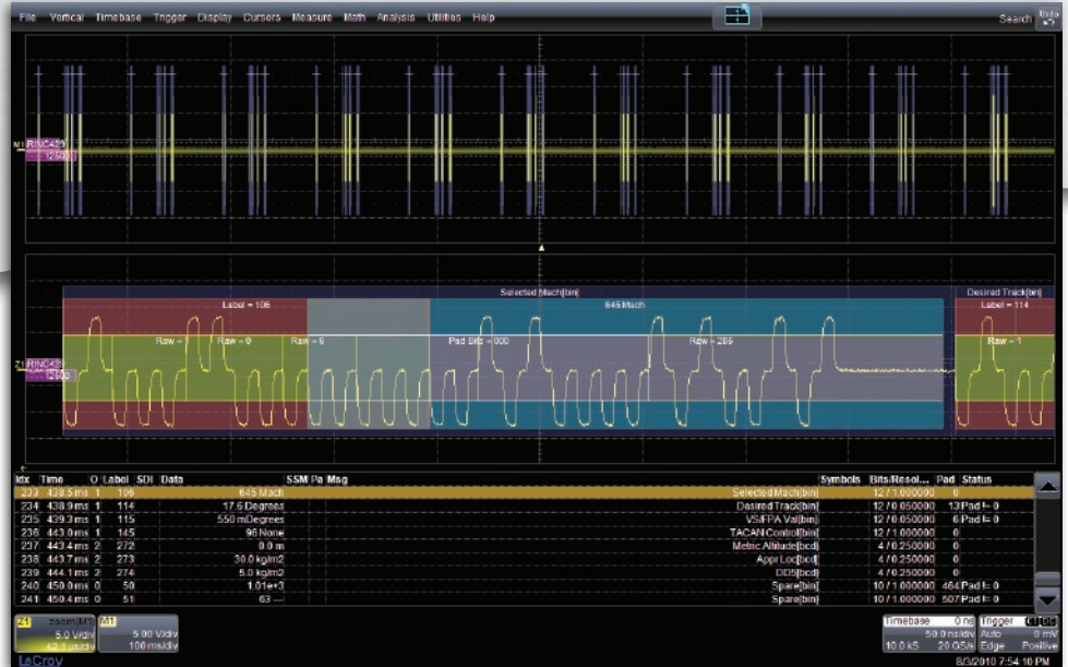
View color-coded overlays on top of the analog waveform for quick identification of the ARINC 429 word. Click on the table to zoom the ARINC 429 word to view individual bits.

The ARINC 429 Decode and Symbolic solution is the ideal tool for system level protocol debug as well as problem solving for signal quality issues. The ARINC 429 Decode and Symbolic package adds a unique set of tools to your oscilloscope, simplifying how you design and debug ARINC 429 systems.