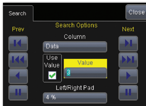
Search for all data values of 00x3 within the entire record. View next, previous, or play through all of the occurrences.

Search through a long record of decoded data by entering any of the 28 available search criteria by entering a value, or simply finding the next occurrence.