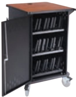
mLT30 CHB - student side shows easily accessible laptop storage