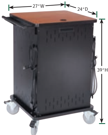
Instructor side, removable panel