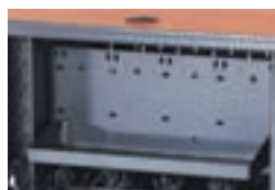
Wire Management Tray 55316 (tray holds blocks and wires for 10 mini's)