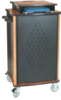
LT15 CHB - with presenters module, from instructor side