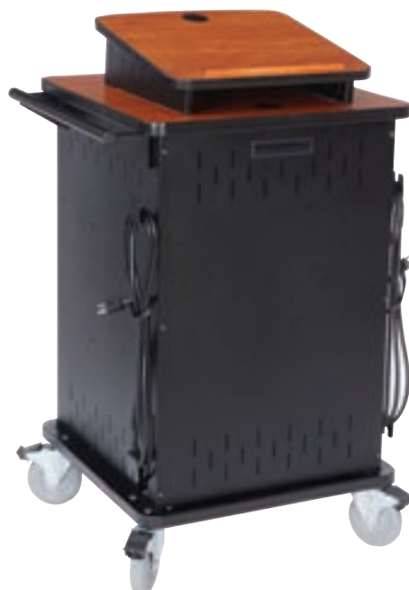
Instructor side shown with optional Lectern Riser (95002)