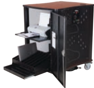
Harbor CHB - shown with optional pull-out tray and superior cable and cord management system