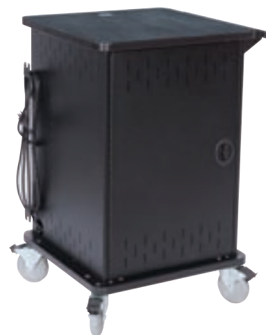
Student side, locking door