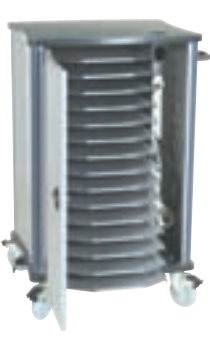
LT15 ID - horizontal storage for up to 15 laptops