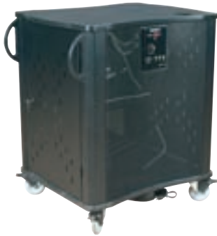
Harbor IB - vertical storage for up to 32 laptops, secure charging provided through the cycle charger (standard)