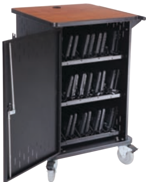
Student side, laptop access

▲ Netbooks provided by ByteSpeed. Find more information at: www.bytespeed.com