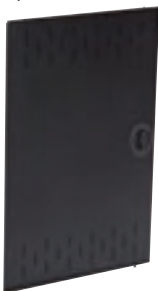
Rear Door 55317B (replaces standard steel panel)