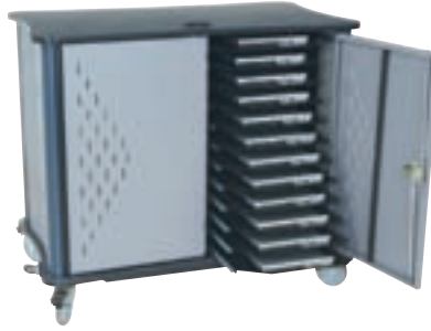
LT24 ID - horizontal storage for up to 24 laptops, shown from the student side