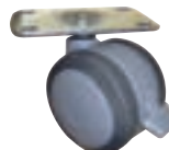
3" Locking Caster (alternative to standard balloon wheel)