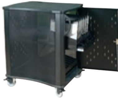
Harbor IB - vertical laptop storage is accomplished by utilizing up to four storage modules