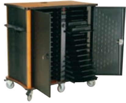
LT30 CHB - horizontal storage for up to 30 laptops, shown from instructor side