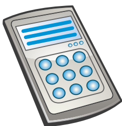
Wireless Response Devices

Specialized devices integrated into the whiteboard further extend the capabilities of the interactive lesson. Teachers and students can use a document camera to convert two-dimensional objects (such as a page from a book) or three-dimensional objects (such as a frog) into digital images that appear on the whiteboard for all to see. With a “digital frog” on display in a biology class, for example, the teacher can discuss and illustrate the animal’s anatomy in the interactive whiteboard session, revealing its internal organs one by one.