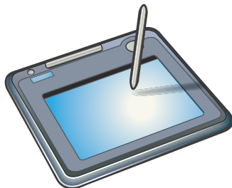
Wireless Electronic Tablets

When connected to a computer, the whiteboard becomes a live computer desktop. Software templates such as graphs, music staves, flowcharts, and frameworks for brainstorming are usually provided with the whiteboard. Teachers who use interactive whiteboards report increased student interest and engagement. In addition, they note that students who previously had difficulty with visual or auditory activities in the traditional classroom can reinforce their learning through activities involving touch and movement of images on the whiteboard.