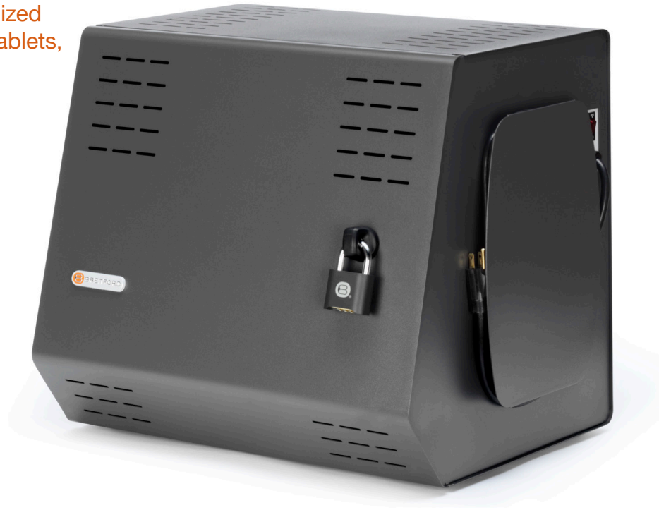
Pictured in Charcoal (CK) finish.