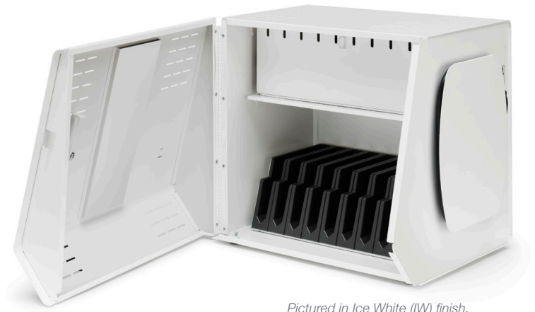
Pictured in Ice White (IW) finish.

Body Charcoal (CK) or Ice White (IW) Branding and color options available. Call for details.