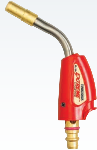
PL-12A Replacement Tip Part No. 0386-0820