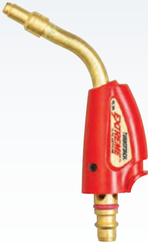
PL-3A Replacement Tip Part No. 0386-0874