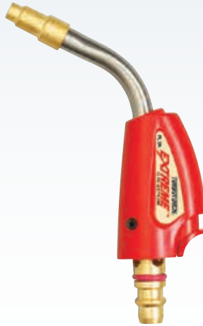
PL-5A Replacement Tip Part No. 0386-0818