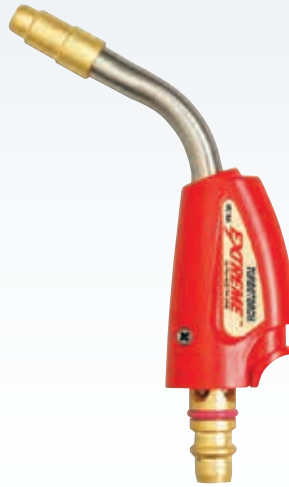
PL-8A Replacement Tip Part No. 0386-0819