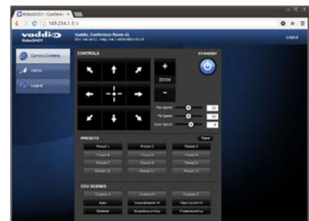
Example: Built-in Camera Control Web Page