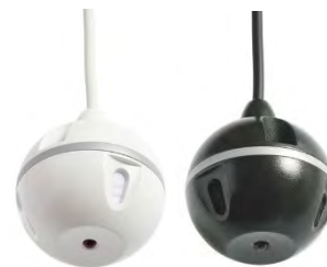
EasyMic Ceiling MicPODs (above) and EasyMic MicPOD (below)