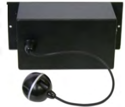
TRIO Ceiling Mic with Above-ceiling electronics enclosure, drop cable and 2.5" spherical array (in black)

Pair the TRIO Mics with the TRIO Mic I/O interface to produce four (4) standard, balanced line level output channels and simply connect the signals to the room audio mixer. Connecting a single echo canceling reference channel from the room mixer to the TRIO Mic I/O completes the interface with any audio mixer.