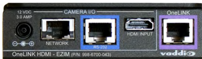
Images: OneLINK HDMI EZIM™ Camera Interface (above) and OneLINK HDMI Interface Front Panel (below).

Vaddio's OneLINK System for RoboSHOT HDMI cameras is an HDBaseT camera extension system that extends HDMI video, power and control on a single Cat-5e/6 cable at distances of up to 328' (100m). OneLINK allows for simplified, economical and faster installations. The OneLINK system sends and regulates power to the camera, provides bi-directional control channels for Ethernet and RS-232 and transmits/receives uncompressed HDMI video up to 1080p/60 and up to 2160p/30 for the future.