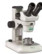
SX Series Stereo Microscope