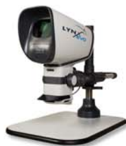
Lynx EVO, Mantis Compact & Mantis Elite/HD Cam Eyepiece-less Stereo Microscope