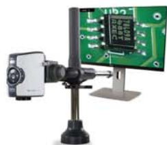
EVO Cam Digital Microscope

Our digital inspection microscope, EVO Cam, offers stunning image quality, live video streaming and a large field of view and working distance. Visit our website for more information.