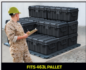
FITS 463L PALLET

Built to move-by forklift, by wheel, by hand.