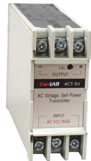
Conlab AC Voltage Transmitter

This document provides instructions on connecting the Conlab AC Voltage Transmitters listed above to HOBO U12 or UX120-006M data loggers or ZW series data nodes via a 4-20mA cable. It also lists recommended configuration values to use for each transmitter when setting scaled values and units using HOBOWare ® software. Note: The Conlab transmitters are self-powered devices. For information on connecting the transmitters to the power source and other transmitter details, refer to the documentation provided by Conlab.