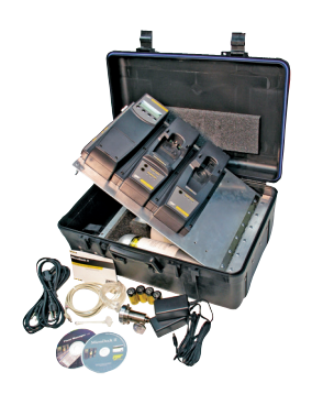
Heavy-duty Case Kit

Use the configurator table on the prior page to create a custom MicroDock II heavy-duty case kit (gas sold separately)