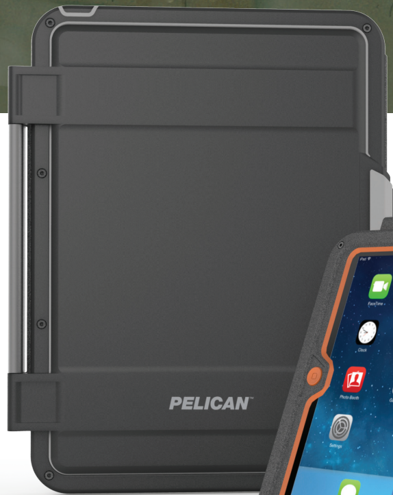
iPad Air - CE2180

NEW VAULT SERIES FOR IPAD® AIR & IPAD® MINI WITH RETINA DISPLAY