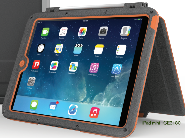
iPad mini - CE3180