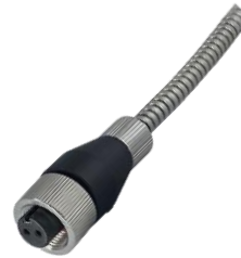
CMCP602A Series 2 Socket Locking Collar, Hose Armored Cable