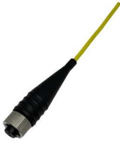
CMCP602H Series 2 Socket Locking Collar High temperature Cable