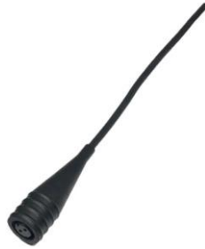
CMCP602LST 2 Socket Push On General Purpose Cable