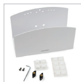
CPU Holder Small: 80-063-200 (black) 80-063-216 (white) Medium: 97-468-202 (silver) 97-468-216 (white)