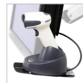
Scanner Shelf, VESA Attach 97-815 (black) 97-815-062 (white)