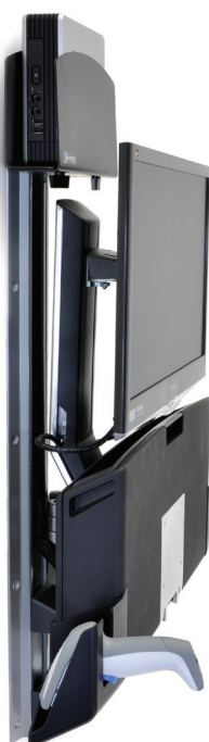
StyleView Sit-Stand Combo System with Worksurface and Extender Arm folds to 8" (20,3 cm)

Arm extends and retracts; fold back out of the way when not in use. Work sitting or standing with the arm's ergonomic 25" (64 cm) LCD height adjustment range. A unique cable management system conceals and organizes cords, making cleaning easy.