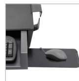
Mouse Tray Upgrade Kit 97-805-055 (black) For older versions of StyleView Sit-Stand Combo Arm with Worksurface