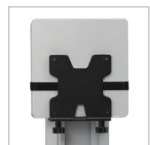
Thin Client Mount 80-107-200 (black) 80-107-216 (white)

© 2015 Ergotron, Inc. rev. 10/29/2015/EA Literature made in the U.S.A. Content is subject to change without notification