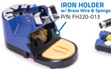
IRON HOLDER w/ Brass Wire & Sponge P/N: FH220-013