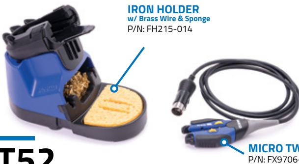
IRON HOLDER w/ Brass Wire & Sponge P/N: FH215-014