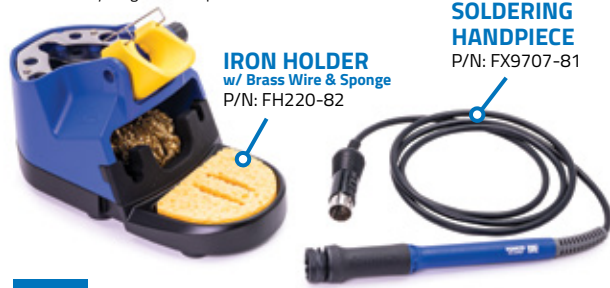
IRON HOLDER w/ Brass Wire & Sponge P/N: FH220-82