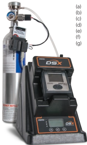
MX6 iBrid DSX Docking Station shown with a Demand Flow Regulator (18105841) and cylinder connected to an iGas® Reader (18105684).