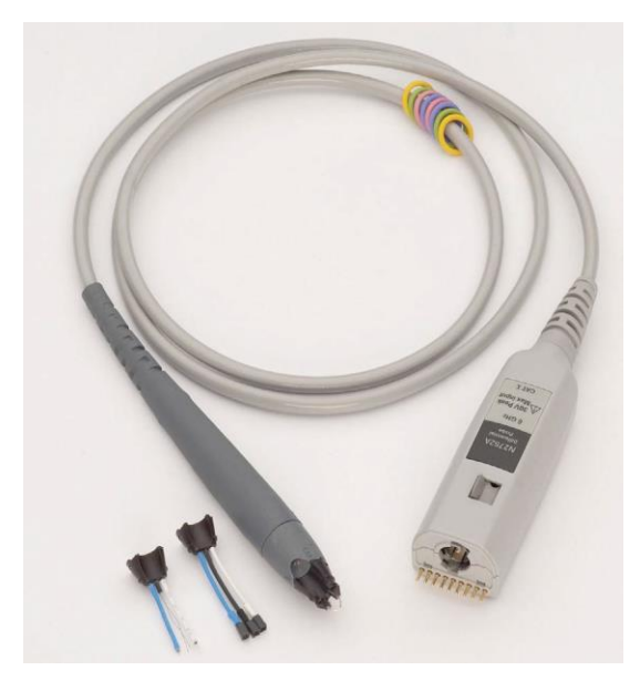
Keysight's InfiniiMode N2750A Series differential active probe.

During the design and debug phase of product development, engineers often need to test "live traffic" in their hi-speed designs (non-compliance testing). In this case, a test fixture is not required, but a differential active probe with sufficient bandwidth is required. For this use-model of testing, Keysight recommends an InfiniiMode N2750A Series differential active probe.