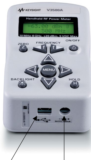
Figure 1. Signal connection

USB type Mini-B port for connection to PC