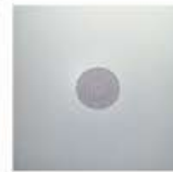
2X2IC6NA - 8 Ohms, 6.5", 2-Way