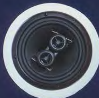
IC6 DVC - 6.5" WOOFER DUAL VOICE COIL