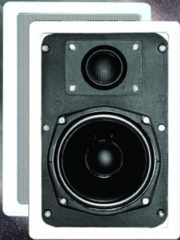
IWST52-5 1/4", 2-WAY