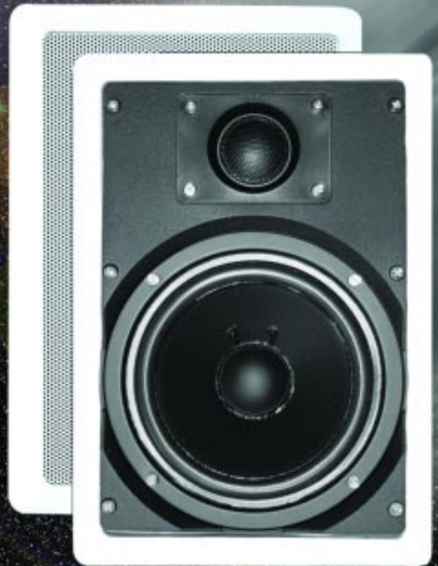
IWST62-6 1/2", 2-WAY

OWI Incorporated 17141 Kingsview Avenue Carson, Ca 90746-1207 USA Tel: (310) 515-1900 www.owi-inc.com