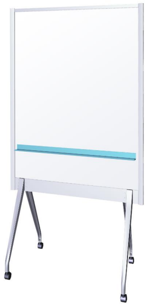
① Light Grey