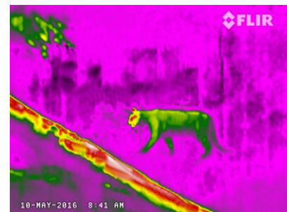
Rain: Well-suited for low-contrast scenes

This product is subject to United States export regulations and may require US authorization prior to export, reexport, or transfer to non-US persons or parties. Diversion contrary to US law is prohibited.