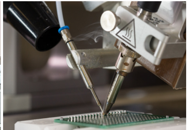
Powerful i-TOOL with precise solder wire feeder and integrated exhaust system for the solder fumes