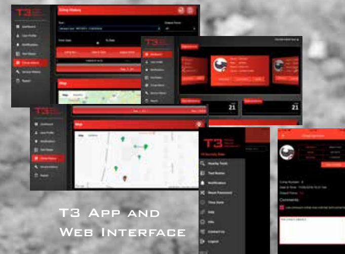
T3 APP AND WEB INTERFACE

TRACK | TRACE | TRANSMIT T3 TECHNOLOGY WITH ONBOARD GPS