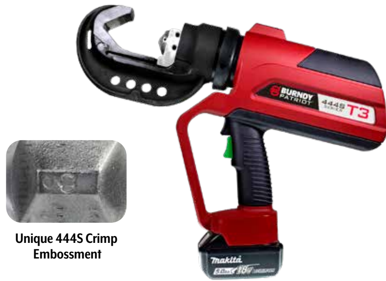
Unique 444S Crimp Embossment