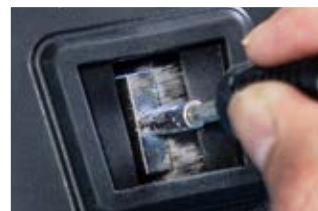
just 1 sec.