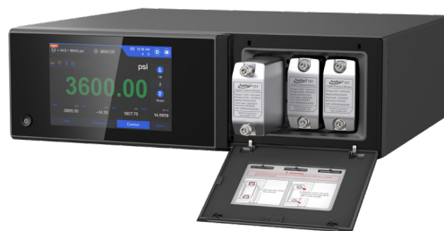
Additel 783 with ADT151 Pressure Modules