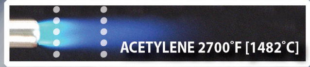
TWISTER TARGET HEAT ZONE