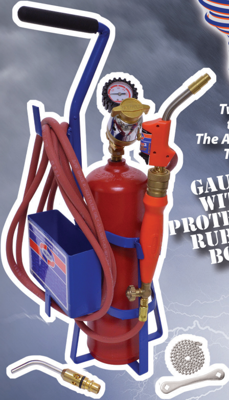
KT2A8XMCC 512 Metal Stand

Twister ® Ignite Kits feature self-igniting swirl combustion technology that produces a high energy efficient flame. The Air Acetylene flame remains stable, even in windy conditions. Twister Ignite Tips are self-igniting and "quick connects" to the ergonomically designed handle.