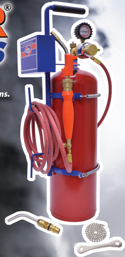
KT2A8XC 502 Metal Stand