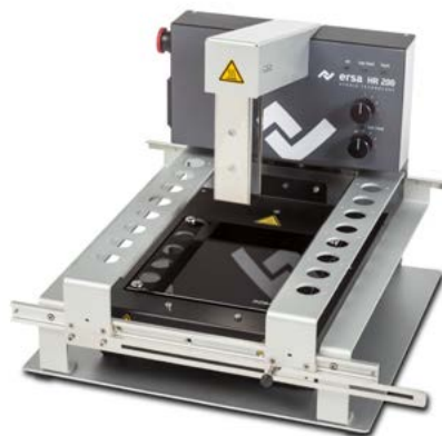
Hybrid Rework System HR 200 with heating plate