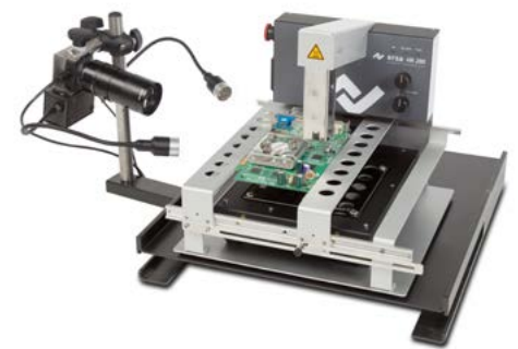
HR 200 with heating plate and reflow process camera