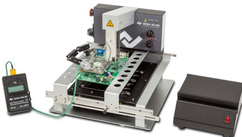
HR 200 with cooling fan and temperature measurement – the right power level for every application

Due to individual settings the HR 200 Hybrid Rework System can handle every job