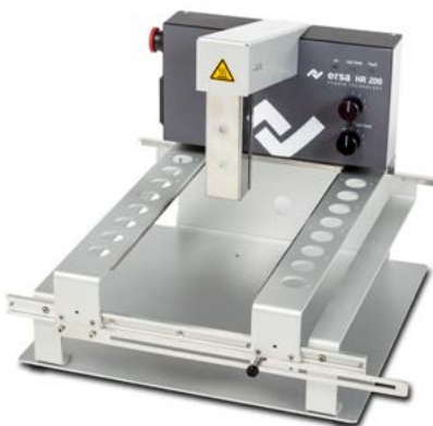
Hybrid Rework System HR 200 without heating plate

Ersa recommends an optional cooling fan, a thermocouple and a temperature-measuring instrument to complete the workplace. Additional accessories including a Reflow Process Camera to observe the soldering processes rounds off the equipment.